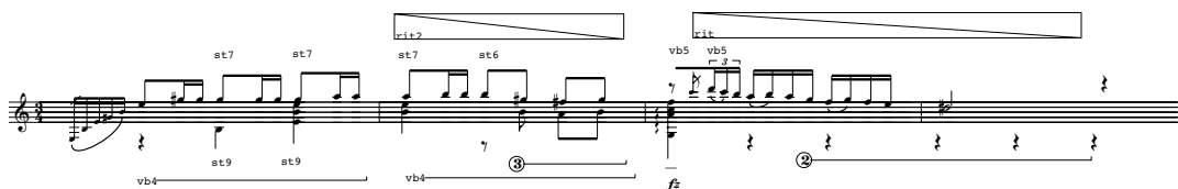
Figure 1. Musical excerpt with ENP expressions.

contain other objects, such as breakpoint functions. The latter case is called a group-BPF. Macro expressions generate additional note events (tremolo, trills, portamento, rasgueado).