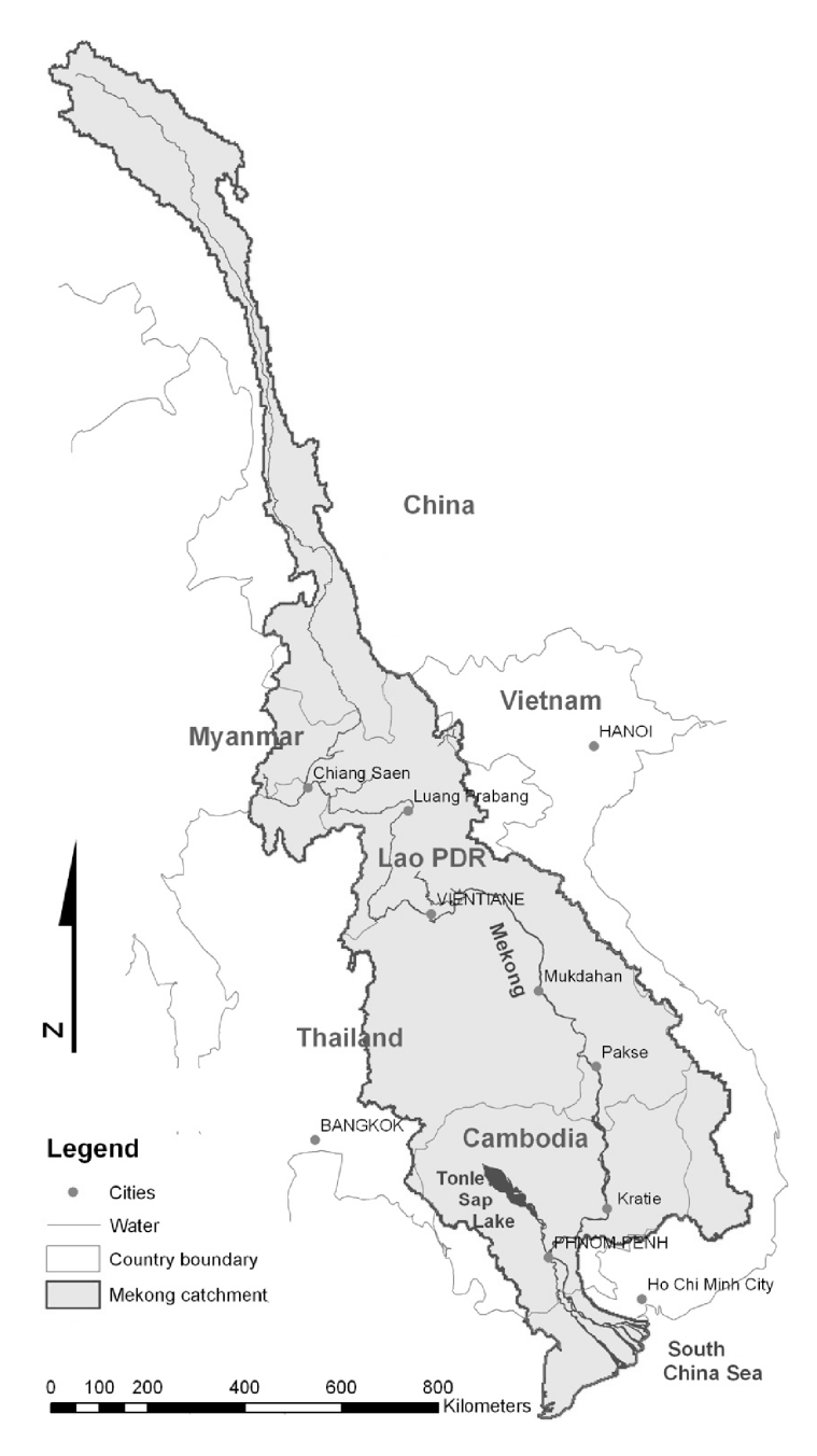
Figure 5.1 Map of the Mekong River Basin.