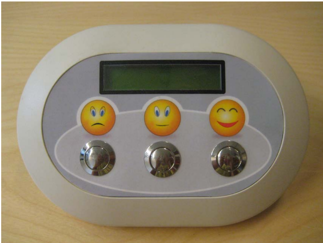
Figure 1. A picture of the Con-Dis device

A detailed description of the Con-Dis device (Figure 1) has been provided elsewhere [21]. Briefly, Con-Dis is a monitoring system that records patients' evaluations of their situation as they perceive it and stores the information for later access. Con-Dis consists of three buttons – happy, neutral, and unhappy – each illustrating the patient's perception of their condition. In the present survey this device was used for evaluating general service quality in care homes for the elderly.